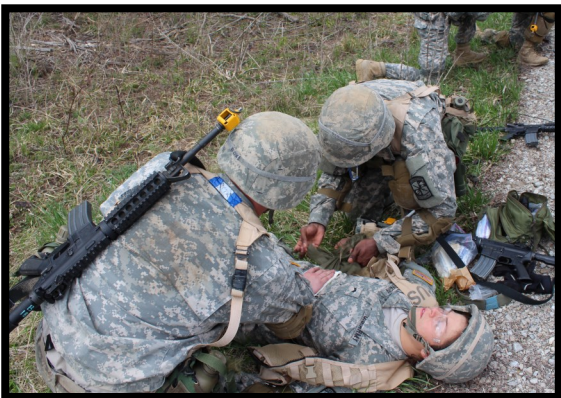
Cadets work through casualty care and buddy aid

breaking them from their original plan of inserting as a platoon. While we experienced numerous lost, hungry, and frustrated Cadets, the lessons learned were unimaginable. The terrain used this year was completely new to the Cadets, and even our MS4s played a crucial role as they learned tactical operating center (TOC) operations. To further challenge training methodologies, we only allowed six MS4s insight into the plan so that the remaining six could actually participate in the exercise without having prior knowledge of the scenarios.