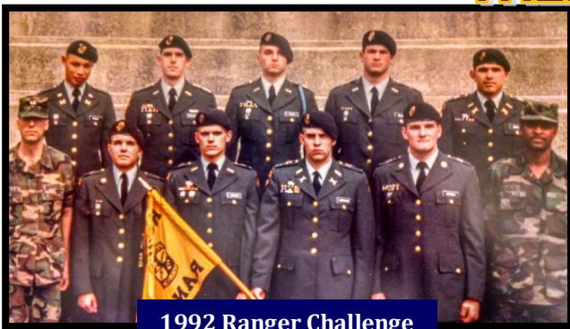
1992 Ranger Challenge