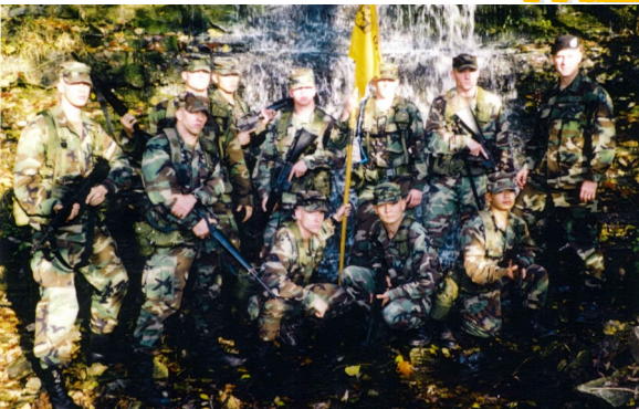
2001 Ranger Challenge— Lake of the Ozarks, MO

A bowl of grog from the most recent dining-in. It really turned out to be more of a casserole than an drink.