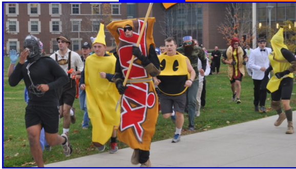
Cadets know how to have fun even when it comes to PT. Halloween Campus Run