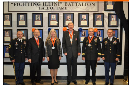
Four inductees at the Hall of Fame

A distinguished heritage was truly understood this October as we recognized seven of our alumni who have distinguished themselves through their contributions to the program, military, or community at large. As campus and community joined in recognizing the efforts of these alumni, it brings to light the impact our Illini have as a result of their initial leadership experience here on campus. We were truly honored to have this opportunity, and our Cadets continue to develop a more complete understanding of the rich traditions and legacy that stems from being a “Fighting Illini.”