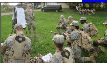
Cadets receive the infamous “butcher block” training prior to an attack practical exercise

into our field problems. In the past we were taught the simple tactics of planning, movement to the objective, and attack. Now, Cadets are working through ethical dilemmas and constant injects to test critical thinking. It is a truly exciting process to watch the Cadets develop through the program as we wait in anticipation to see how they will carry on the legacy of our alumni!