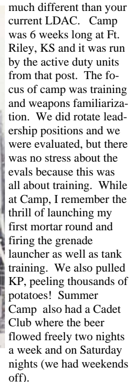
Advanced Camp or Summer Camp as we called it was

"There are some women who are physically, mentally and emotionally capable [of combat] and there are men who are not. The tests for entrance should be identical for both men and women, and as soon as there are some changes in the way that society views the role of a woman, that may be reality." I spoke those words to a Daily Illini Reporter in September 1976. Now almost 40 years later, that reality is here.