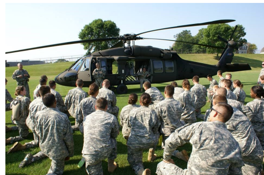
Cadets listen to a helicopter safety brief during the Cadet Orientation Program

contrast to their first year. The freshmen are learning basic military knowledge and Soldier skills to build a solid foundation for future semesters in the program.