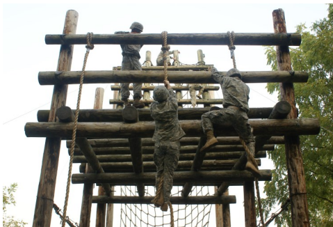
Cadets climbing the rope on the Tough One

The Fighting Illini Battalion conducted its annual Fall Field Training Exercise from 19-22 SEPT at Camp Atterbury, Indiana. The four day training was well planned and executed in a professional manner by the MSIVs.